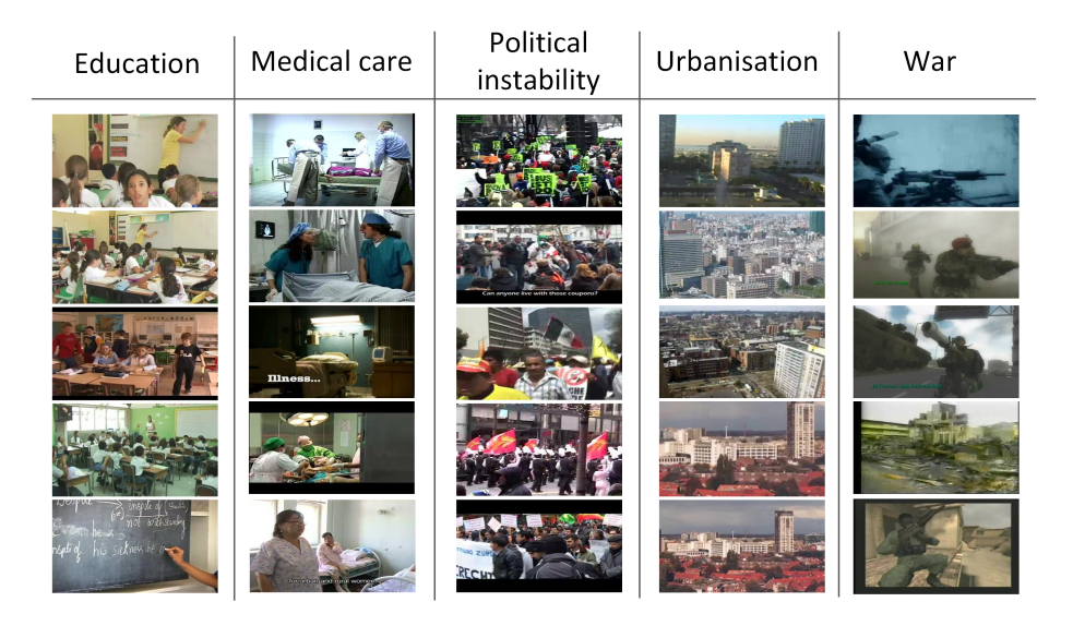
Fig. 3. Example results, for five MRSCs (shown on the top of the figure). The top-5 retrieved shots for each MRSC are shown.

As mentioned before, there is no MRSC-specific dataset to evaluate our approach's performance empirically. For this reason, we only presented results on the TRECVID SIN datasets. However, to further illustrate our approach's performance, we give some visual examples of the retrieved video shots when we use the MRSCs as input to our method. In Figure 3, the top-5 retrieved shots are presented for a subset of the available MRSCs. These selected MRSCs include representatives of multiple categories and both levels of the hierarchical classification (see highlighted concepts in Table 1). Although preliminary, results further point to the potential of our approach as a valid and effective solution in finding shots related to MRSCs.