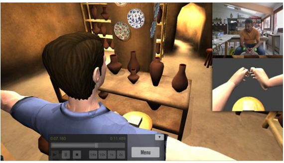
Figure 4 Practice Screen: Angled View of 3D Learner Avatar (Big Central Window), Animation Controller (Bottom Center), Expert Video (Top Right), Close-up on Expert Hands (Center Right).

The application communicates with the Body and Gesture Data Capture and Analysis Module that is responsible for capturing the hand and upper body motions of an expert potter. Specifically, the module can read, process and capture hands animation data from a single Leap Motion sensor (multiple Leap Motion sensors will be supported in the near future) and combine this information with body movement from multiple Kinect sensors. In addition, synchronization and fusion of hand and body animation streams are performed in order to output a single animation stream containing skeletal information of both hands and the body of a person. Also, there is an optional mode available for accurately tracking wrist positions in space, based on blob tracking. This mode significantly improves the quality of captured data but requires the user to wear round coloured markers around the wrists.