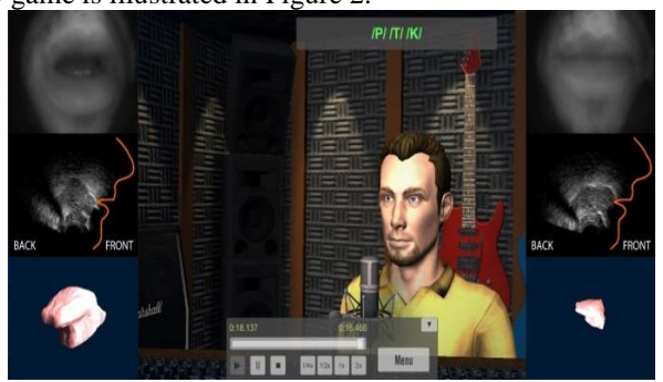
Figure 2 Practice Screen HBB Game.

The learner should practice each activity a number of times, and finally perform all the activities at once. The practice screen of the HBB game is illustrated in Figure 2.