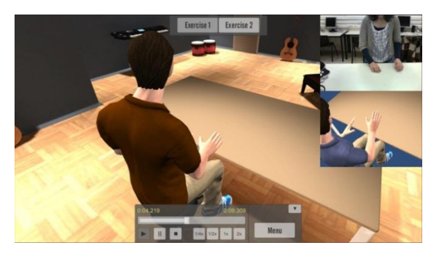
Figure 6 Practice Screen: Isometric View of 3D Learner Avatar (Big Central Window), Animation Controller (Bottom Center), Expert Video (Top Right), Close-up Expert Hands (Center Right).

The musical game activities include observe and practice phases. In the observe phase, the learner can observe the video of an expert performing a musical gesture.