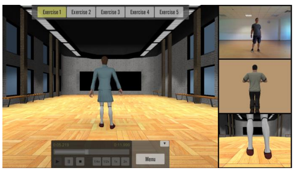
Figure 3 Practice Screen: Backward View of 3D Expert Avatar (Big Central Window), Animation Controller (Bottom Center), Exercise Indicator (Top Center), Expert Video (Top Right), 3D Learner Avatar (Center Right), Backward View of Close-up Expert Legs (Bottom Right).

If the imitation is completed properly, the learner can proceed to the next exercise. Otherwise, the learner is expected to repeat the same exercise till s/he does the moves correctly. Although the exercises progress sequentially, in some cases the learner has to repeat not only the previous exercise but also some more. A screenshot from the Practice Screen is shown in Figure 3.