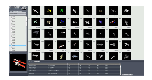
Figure 5: The models that are retrieved by Chaouch's MDLA method for an airplane as the query object.

Table 2 shows the retrieval statistics for all the methods and runs. It is clear that based on all the five scalar measures the MDLA approach proposed by Chaouch and Verroust gave the best performance among all 22 methods. Lian's composite descriptor, which is a combination of four methods (RECT + SHD + GSMD + MR) got the second place considering overall performance. Nearest Neighbor indicates the relevance to the query of the first retrieved result. If we based the evaluation on NN, Napoleon's MCC-Run2 and MCC-Run3 would be in second and third places. But we take into account all the performance evaluation measures then Chaouch's MDLA is in the first place, Lian's Rect+SHD+GSMD+MR is in the second place and Napoleon's MCC-Run3 is in the third place.