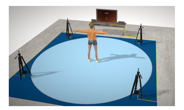
Figure 3: Four sensors perimetrically cover the capturing space where the user is placed watching and playing the game on a large screen.

<sup>1</sup>https://github.com/VCL3D/AVoidX