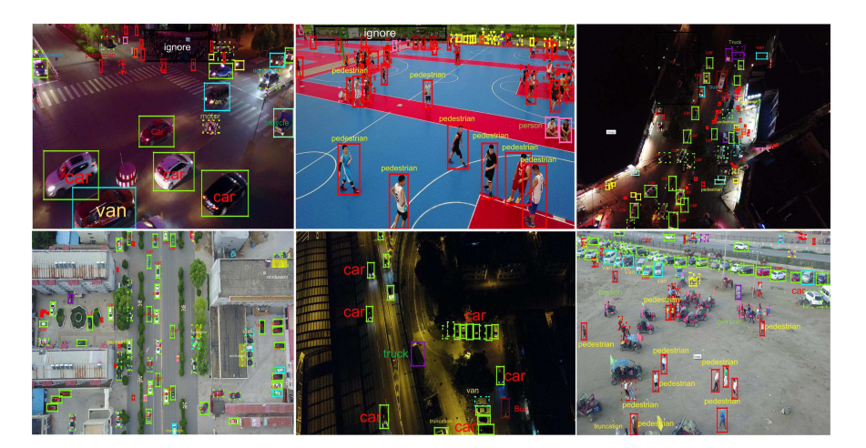
Fig. 3: Some annotated example images of the object detection in images task. The dashed bounding box indicates the object is occluded. Different bounding box colors indicate different classes of objects. For better visualization, we only display some attributes.

number of objects in each image in Fig. 2. The images of the three subsets are taken at different locations, but share similar environments and attributes.