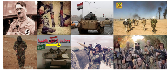
Figure 3: A sample set of images uploaded by key-players with militaristic or nationalistic content. Faces are redacted so as to avoid the inclusion of sensitive information.

detection method. We observe that in all cases examined, the majority of accounts are already suspended and some of them no longer exist. In particular, the modularity maximization methods (FastGreedy, Louvain) are able to retrieve the largest communities and thus more accounts with potentially illegal activity. The percentage of suspended users is 82.76% for the modularity maximization approaches and 78% for the Walktrap and DBSCAN*-Martingale, indicating a marginal advantage for the former. The community provided by Infomap is very small, compared to the other community sizes, but still the number of active accounts (not yet suspended) is only 20%. Figure 3 depicts sample content from such active accounts that have not been marked as suspended by Twitter. One may note that their content is military-themed, indicating potentially suspicious user activity even in non-suspended accounts.