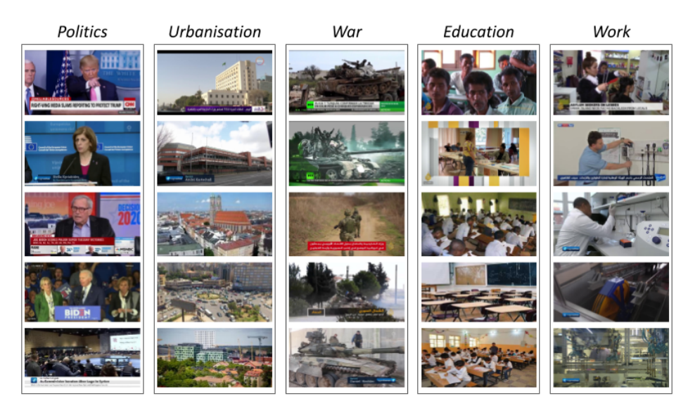
Figure 2: Example results, for five selected MRSCs. The top-5 retrieved images or video shots for each MRSC are shown.